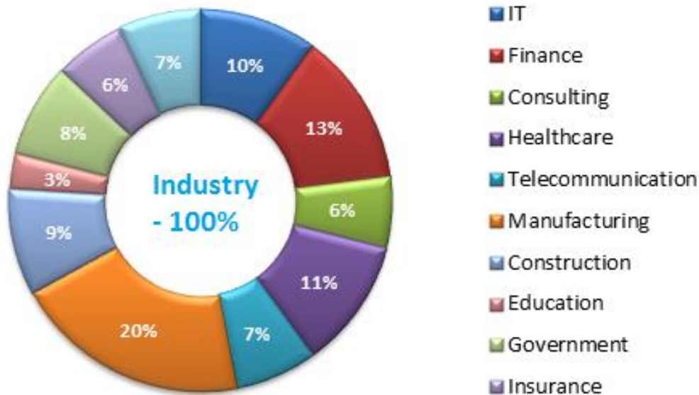
Distribution of companies using Six Sigma by industry

Many say that Six Sigma is only for large companies where they follow lot of processes. However, survey conducted by 6sigmastudy revealed that it is equally adopted by small to medium sized organizations as well. The figure below shows the distribution of companies by employee count.